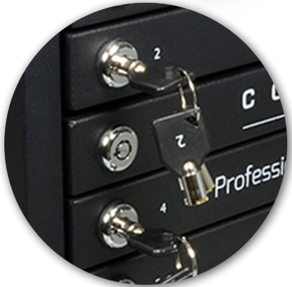
Individual lockable doors Portes individuelles verouillables