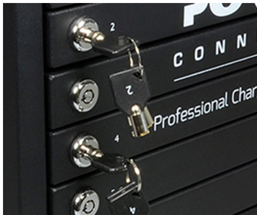
Individual lockable doors