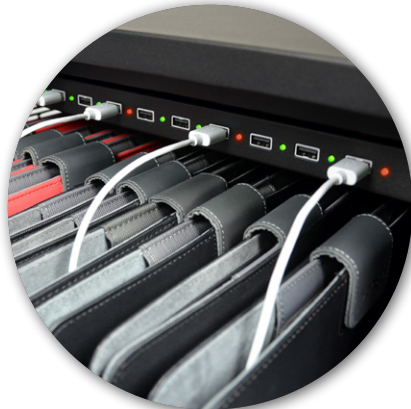
Charge progress LED indicator Indicateur LED de progression de chargement