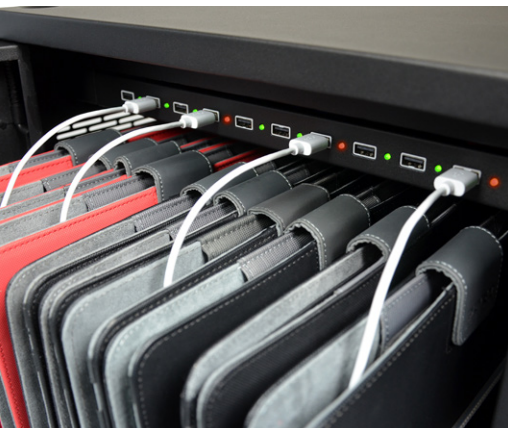
Charge progress LED indicator